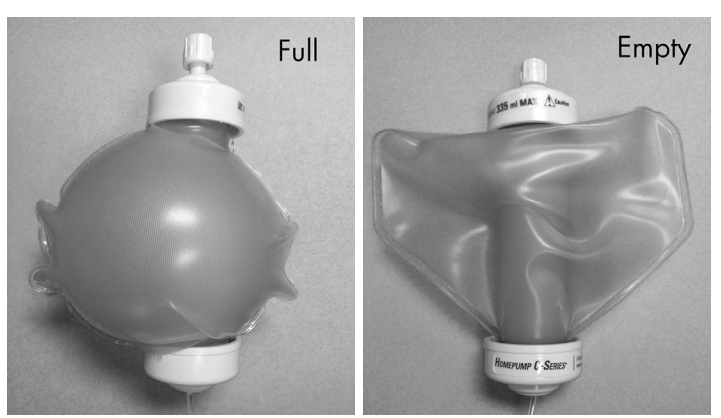
The above is an example of what the elastomeric device would look like when full and empty.

NEVER squeeze the elastomeric device. The elastomeric device will apply gentle pressure on its own to push the medication through. If you try to help by squeezing the device you could end up causing a leak, or push the medication in too quickly.