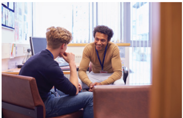
Home and Community Care Support Services | 21